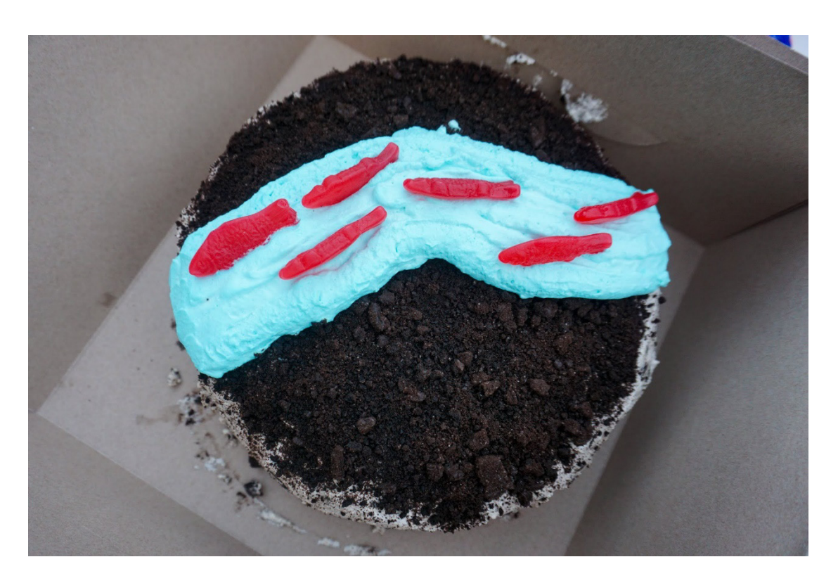
Coal Creek themed cake!