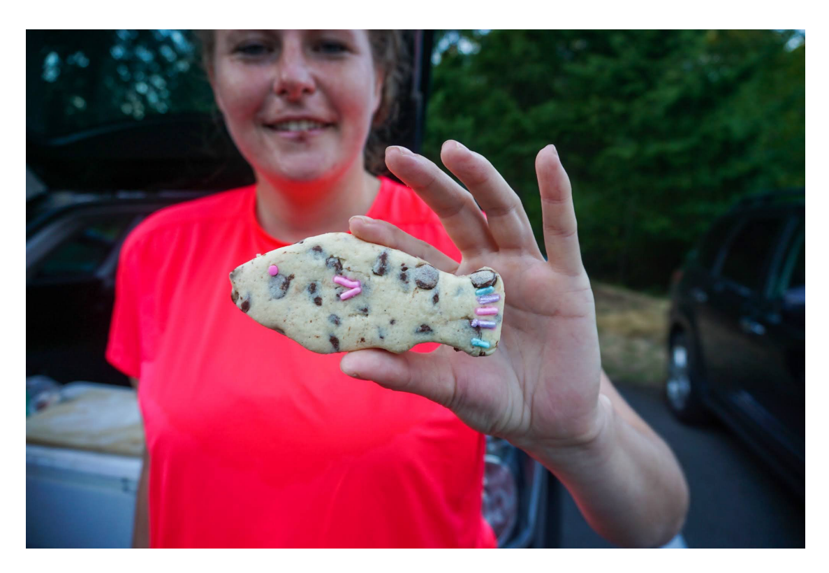
Even some fish-themed treats!

The Save Coal Creek campaign has been years in the making, and we hope the <u>recent success</u> leads to conservation of this land for many generations. Please consider making a donation to Issaquah Alps Trails Club, which fiscally sponsors Save Coal Creek.