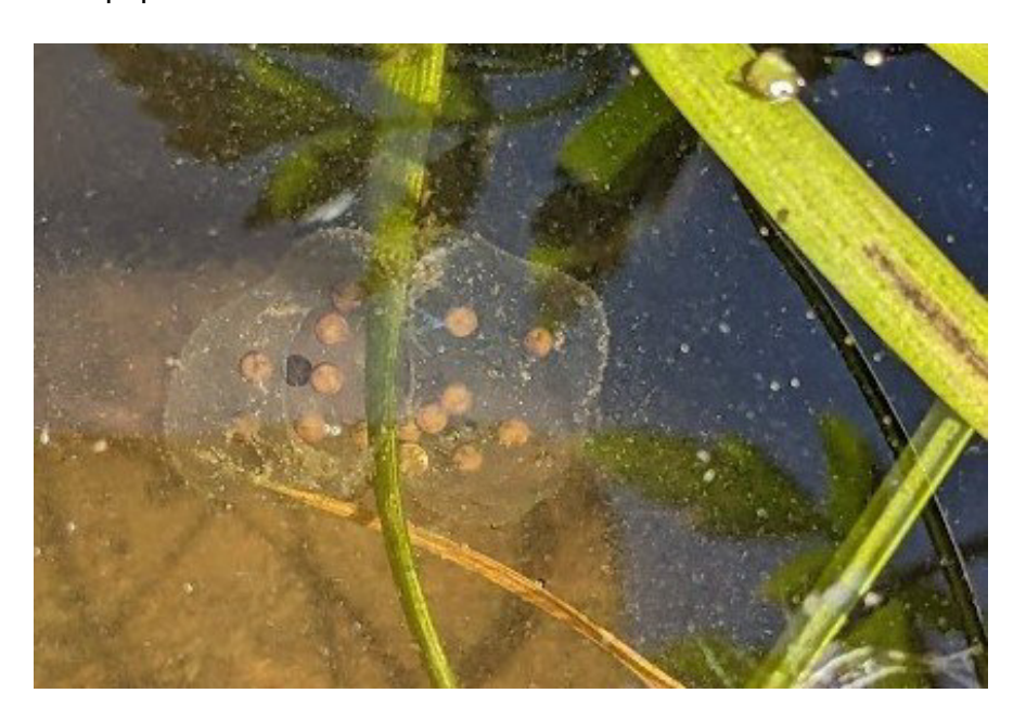
Pacific Tree Frog egg mass

Hilary says, "We have learned that context matters deeply, and that patient and repeated visits to a place make the familiar unfamiliar as new questions arise and unsolved mysteries appear. We've seen many egg masses - but it's more difficult to document the juvenile stages. So we wonder, how many hatchlings survive and populate the woods?"