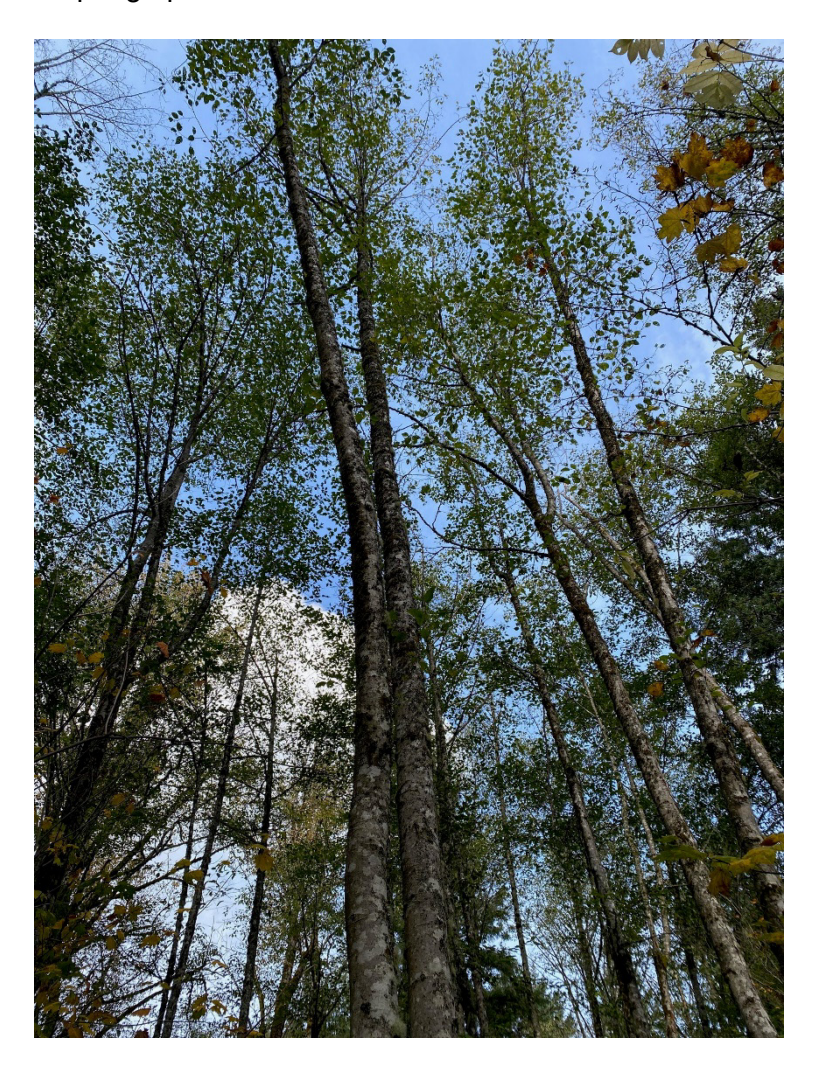
Red Alder near Cave Hole/Quarry Trail, Fall 2022

Today, areas around De Leo Wall and Wilderness Peak still feature a high density of conifers. However, red alder dominates large portions of Cougar Mountain, particularly in the northwest and middle regions, as it's the first species to spring up in disturbed areas.