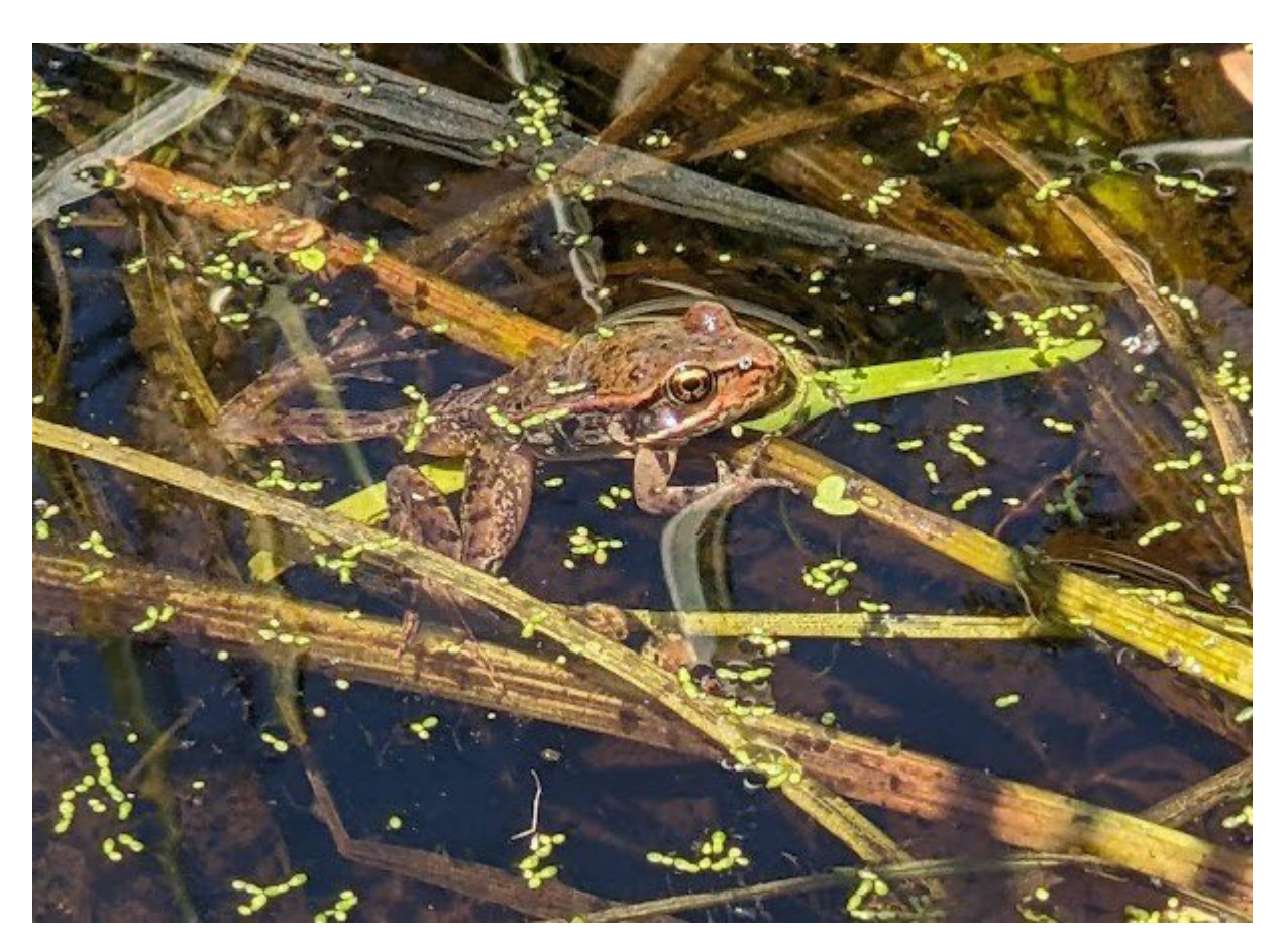
Northern Red-legged Frog

Amphibians are thin-skinned - they depend on wetlands and streams for the egg-laying part of their lives, and some species need wet habitats for much longer. They are the only vertebrate animals without fur, scales or feathers and are considered "indicator species." The health, diversity and numbers of amphibians breeding in and around our ponds and forests reflect the quality of the environment around them.