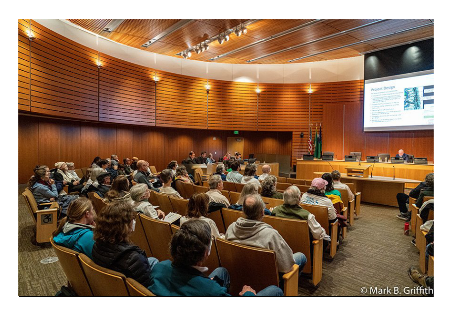
March 2nd hearing at Bellevue City Hall

Thank you to everyone who attended the March 2nd public hearing at Bellevue City Hall. It was a packed house, with supporters of Save Coal Creek attending both in person and virtually. Attendees and council members heard from many supporters, who gave thoughtful and impactful testimonies on record to support Save Coal Creek.