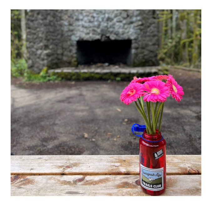
In remembrance of Harriet Stimson Bullitt

We honor the memory of the Bullitts by our unceasing efforts to protect these lands and to preserve those still in need of saving.