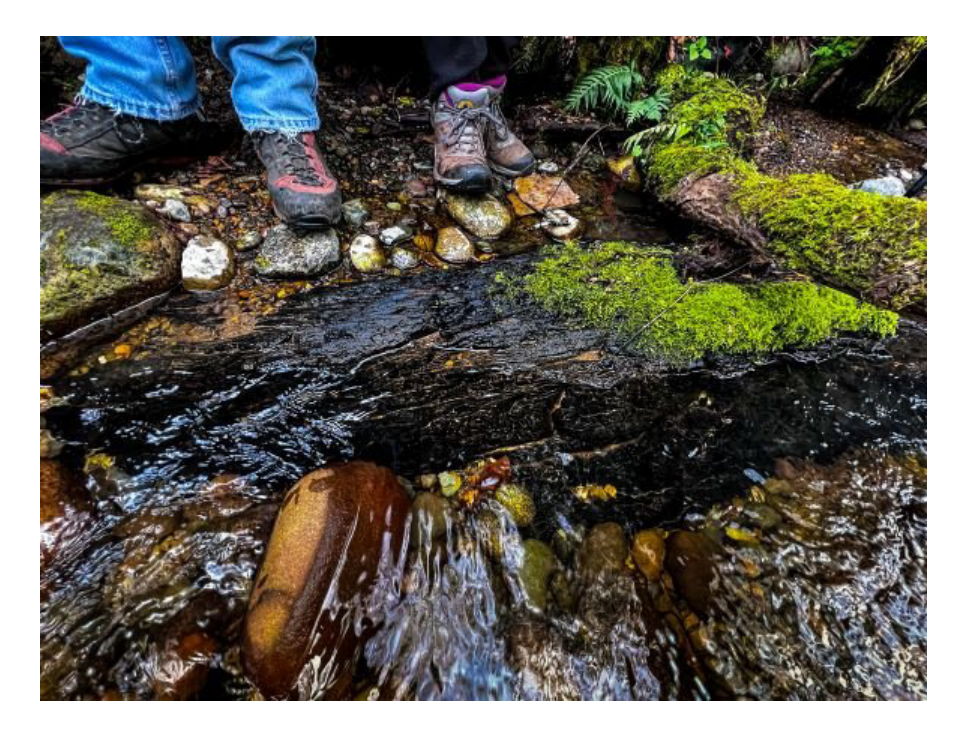
Exposed coal seam in the bed of a small stream