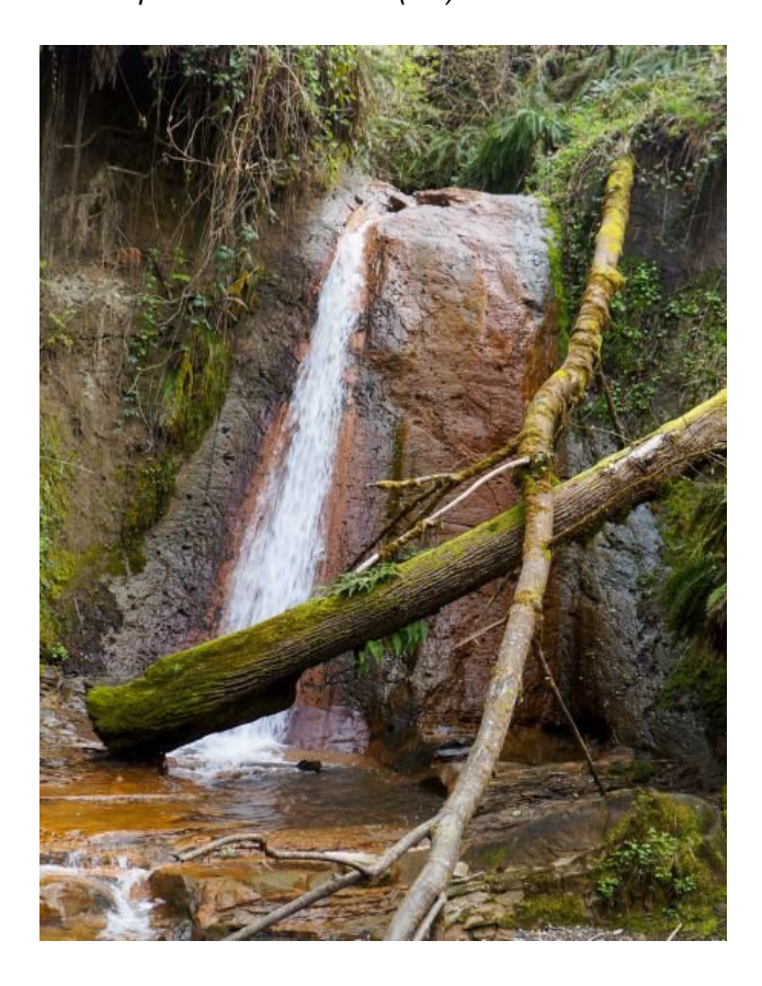
North Fork Falls with glacial till on top and sedimentary rock at its base.