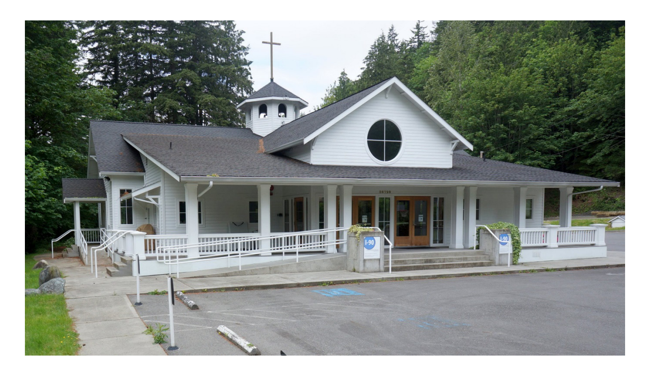
The old High Point schoolhouse, now a church. The bell tower, typical of schoolhouses of the day, remains.

The mill has disappeared, but what about the remnants of the logging operation on the slopes of Tiger Mountain? Is there anything left to be seen? Yes - some easy to see and some more subtle. The High Point Trail follows the route of a logging tram that was used to bring the logs down the mountain from the West Tiger Railroad grade, and numerous artifacts can be found along the trail. And the West Tiger Railroad grade is itself a logging artifact as its sole purpose was the transport of logs from elsewhere on West Tiger Mountain to the intersection with the logging tram (known as the "Wooden Pacific") that brought the logs down to the mill. That intersection is known as "Fred's Corner."