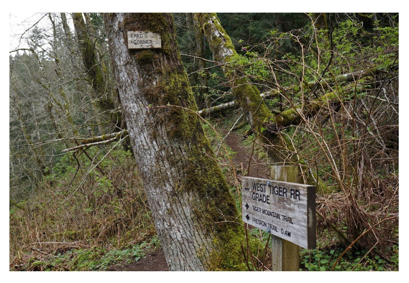
Fred's Corner on the Tiger Mountain Trail/West Tiger RR Grade.