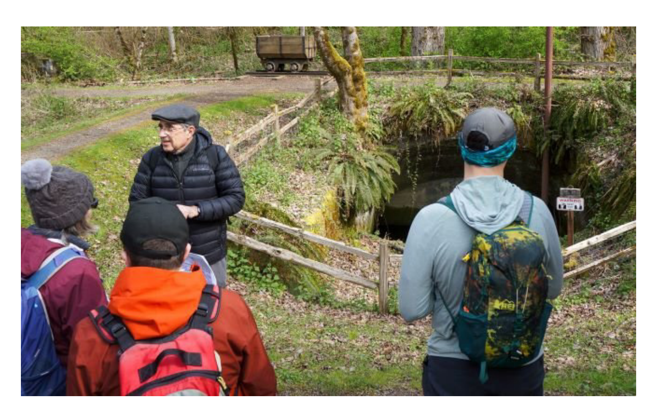
At the entrance to the Ford Slope mine.