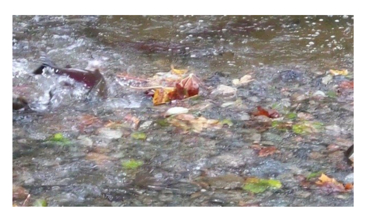
Hatchery Coho salmon released in Coal Creek November 2021