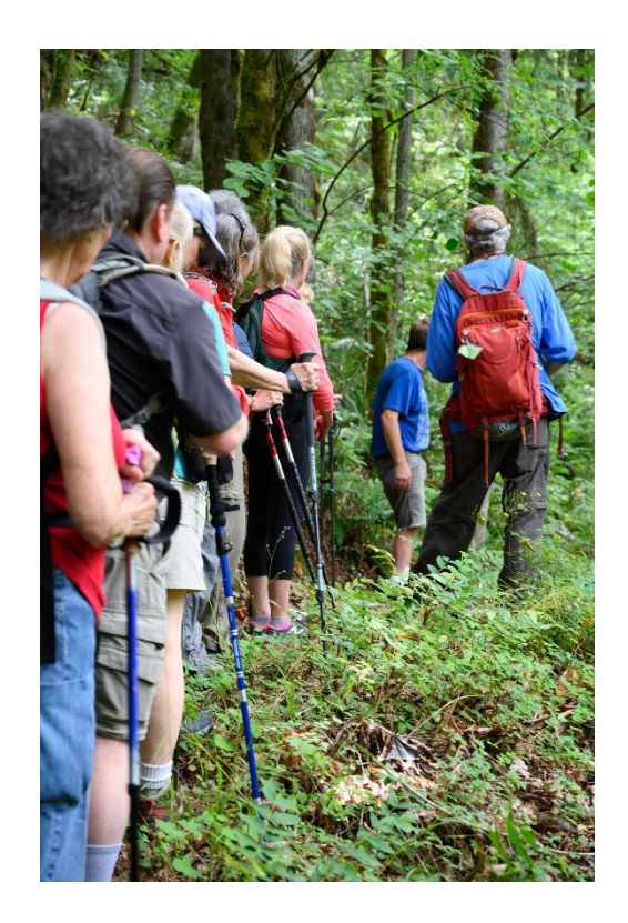
We're looking forward to seeing all of your amazing photos!