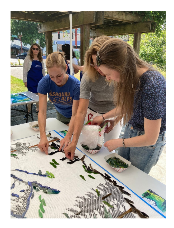
The Alpiner September 2021 Page 10 of 13