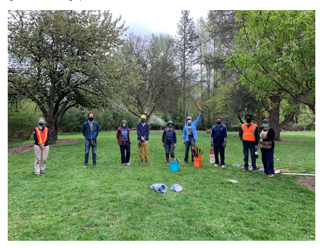
Issaguah Alps Trails Club: Green Issaguah Restoration at Berntsen Park

National Public Lands day celebrates the hard work that has gone into creating and maintaining our nation's public lands. Beginning in 1994, it has become the single largest volunteer day for conservation efforts. This year, we are inviting you to celebrate with us and our partners by hiking, restoring habitat, building trails, or cleaning up.