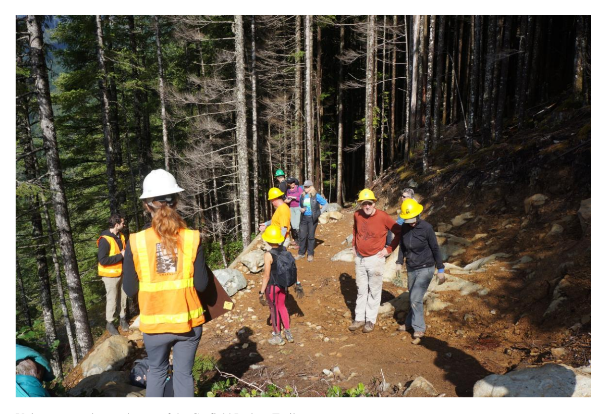
Volunteers work near the top of the Garfield Ledges Trail.