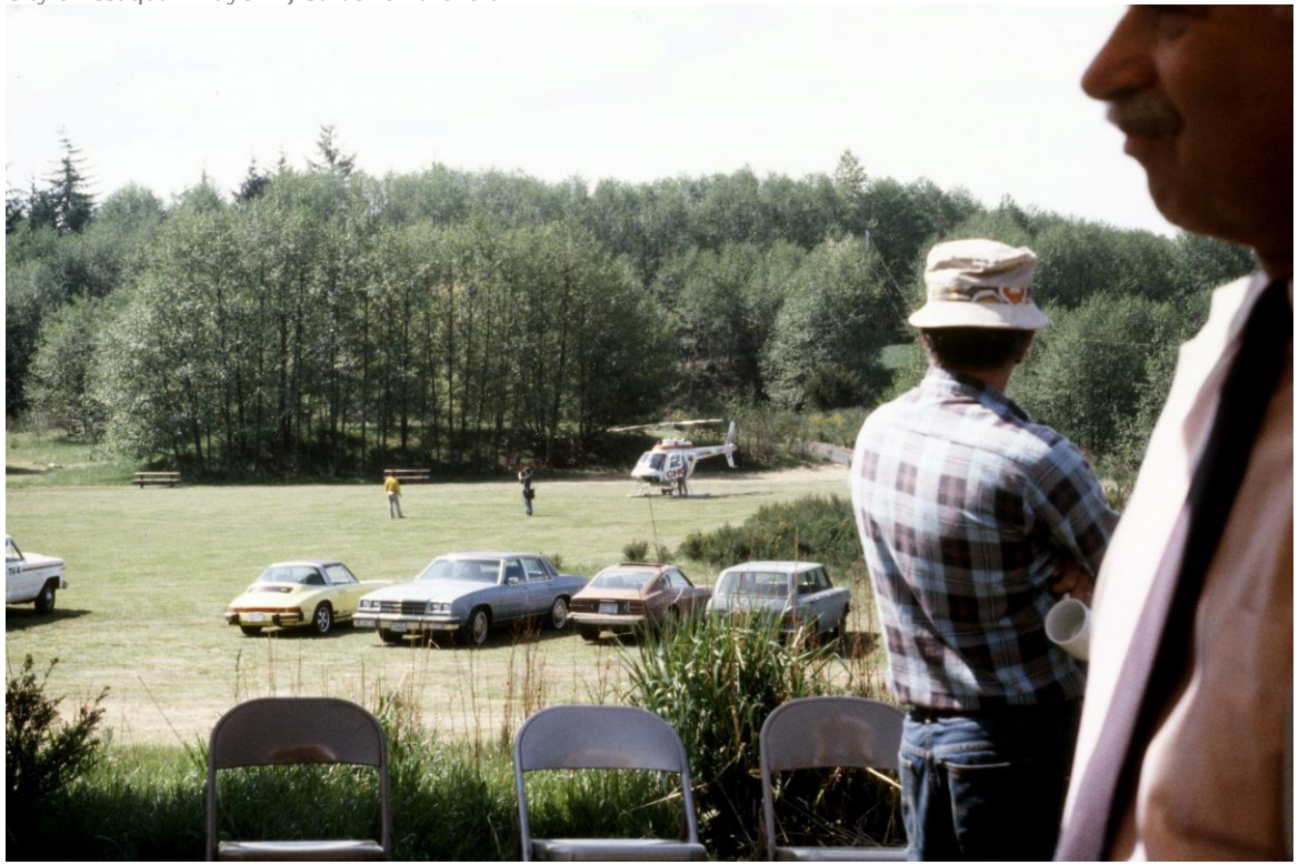
Chopper 7, even.