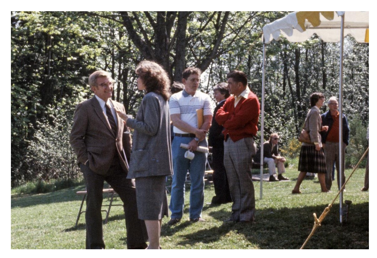
City of Issaquah Mayor AJ Culver on the left.