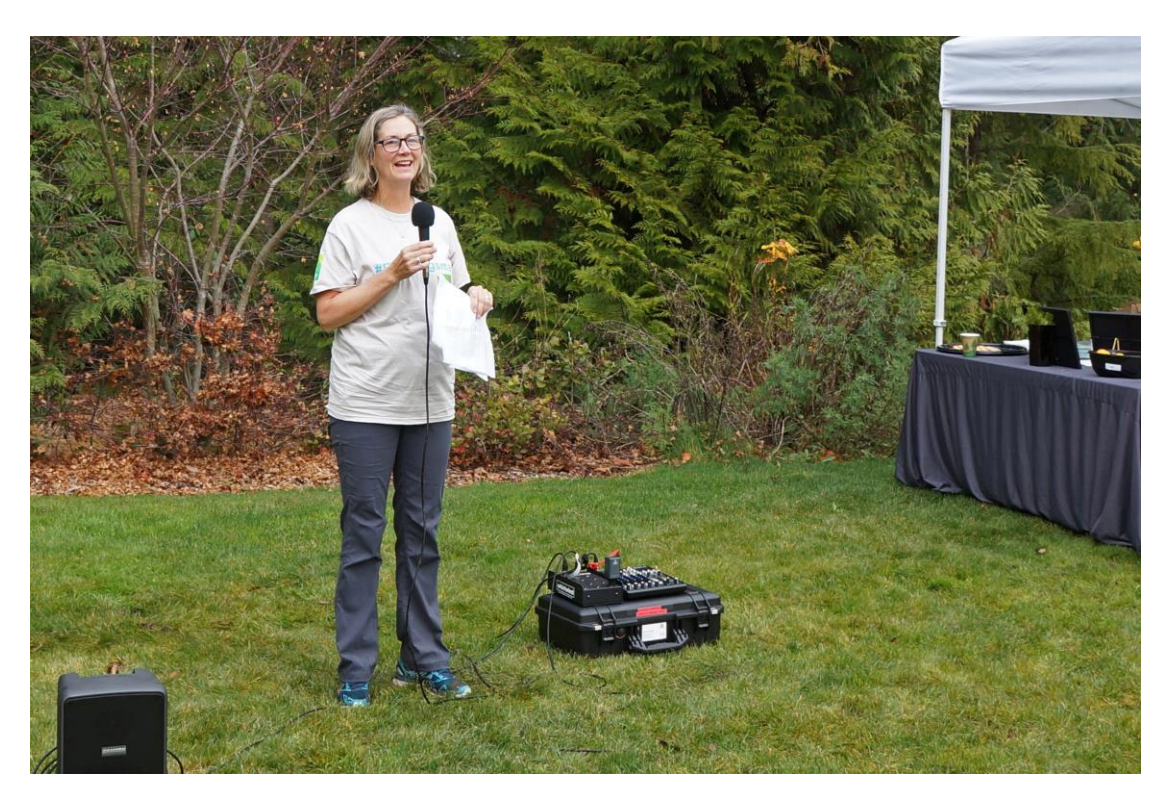
City of Issaquah Mayor Mary Lou Pauly reflects on the challenges that were met.