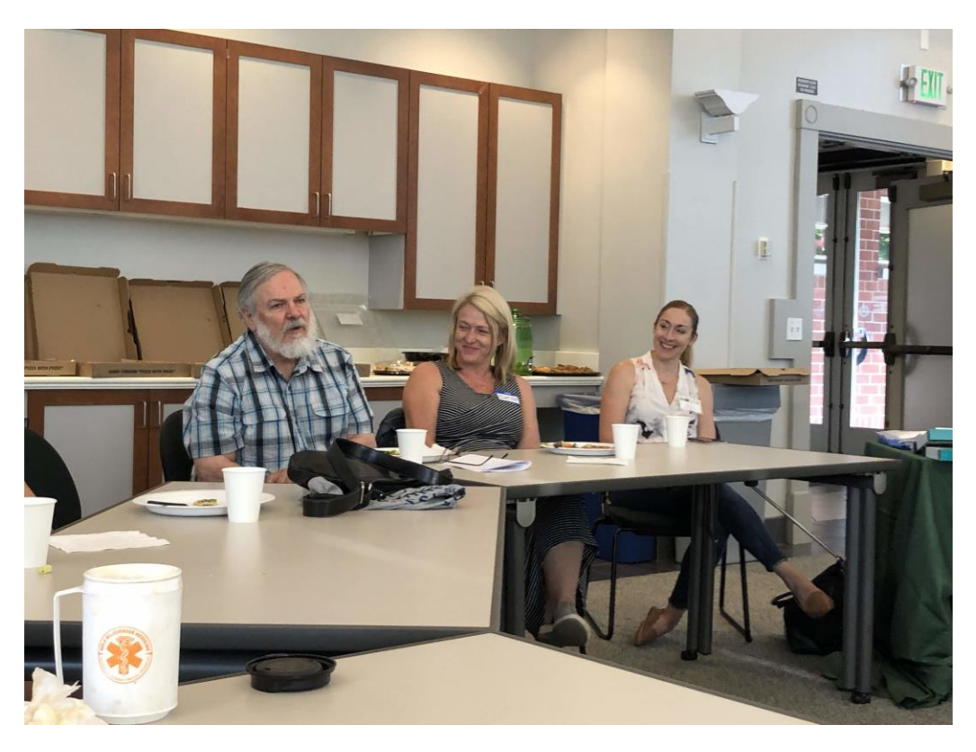
Many stories of happy and challenging hikes were shared as pizza from Flying Pie Pizzeria was devoured.

Attendees went around the table, introducing themselves, and sharing their best and worst moments as Hike Leaders.