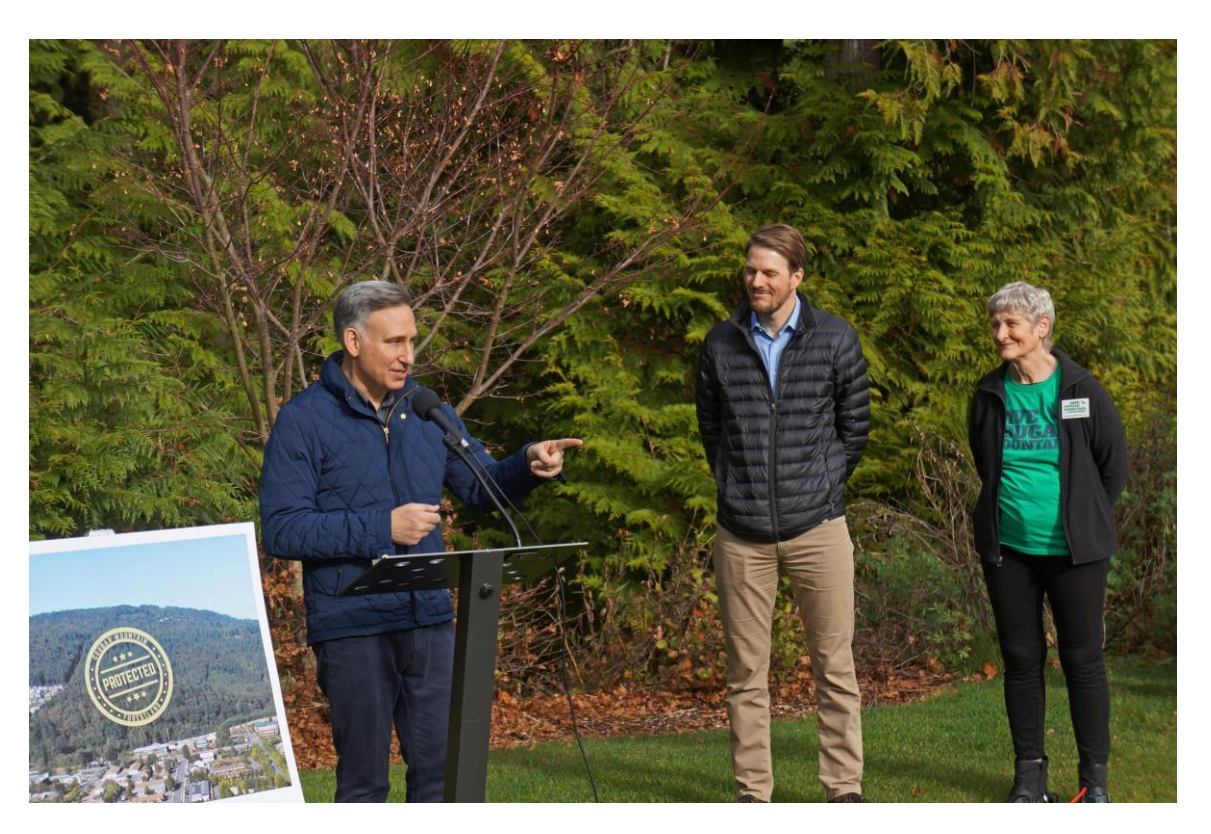
King County Executive Dow Constantine makes a point.