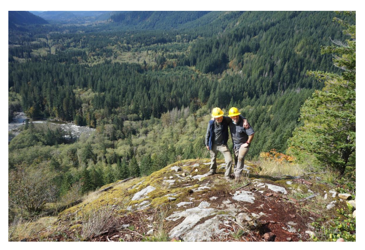
Volunteers pose at the top of the Garfield Ledges Trail.